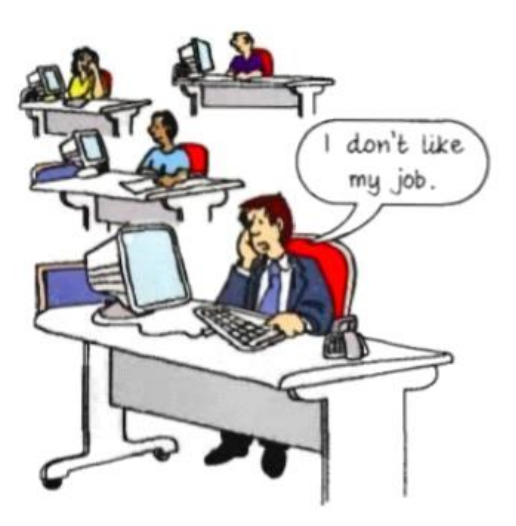
He doesn't like his job.