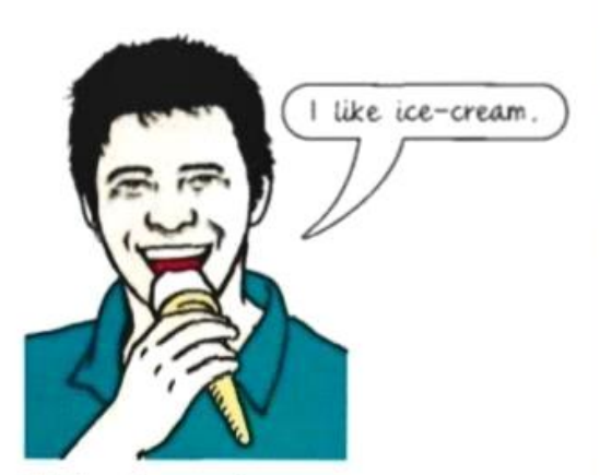
He's eating an ice-cream. He likes ice-cream.

They read / he likes / I work etc. = the present simple: